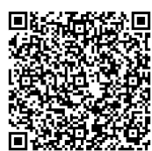
Agrozen Laboratory Authenticity QR Code